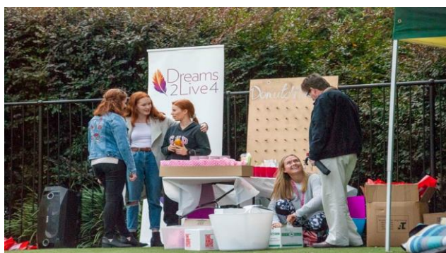
Ladies Day at Chatswood Oval