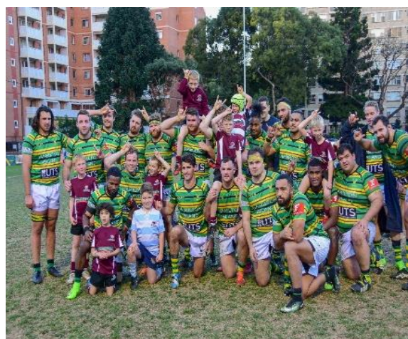
Village Club Days at Chatswood Oval