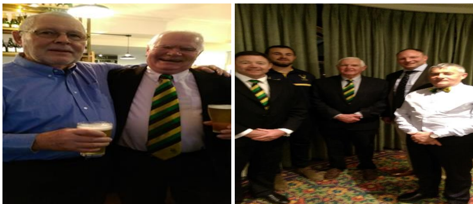
1967 1st Grade Grand Final Team members and current FOGS