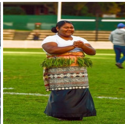
Pacific/ Polynesian Day at Chatswood Oval